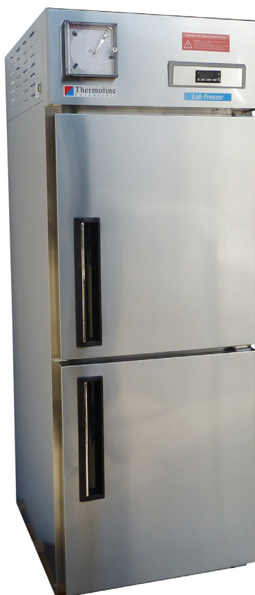
Image: TLUF-520-2D shown with optional chart recorder