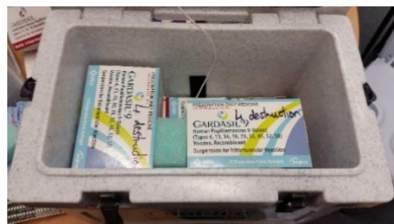
Gardasil only = 5 boxes