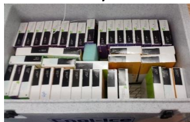
Boostrix only = 43 boxes