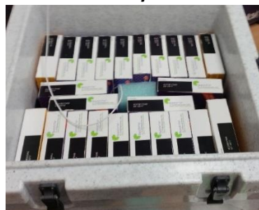
Boostrix only = 24 boxes