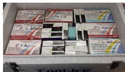
equal Boostrix & Gardasil = 14 boxes of each

Note: gap in 41L chilly bin photo is because not enough boxes of vaccine were available to fill the gap.