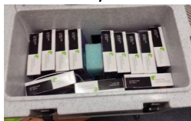
Boostrix only = 12 boxes