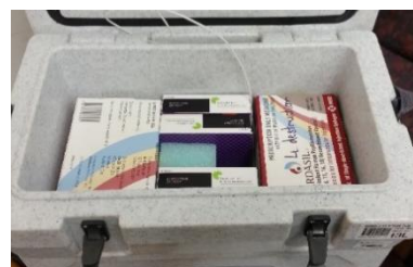
equal Boostrix & Gardasil = 4 boxes of each