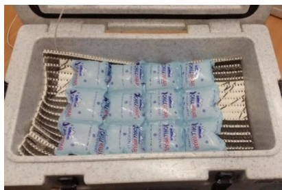
13L packed chilly bin