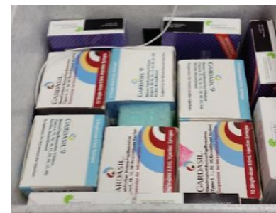
equal Boostrix & Gardasil = 6 boxes of each