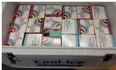
Gardasil = 18 boxes