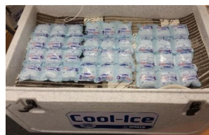
41L packed chilly bin