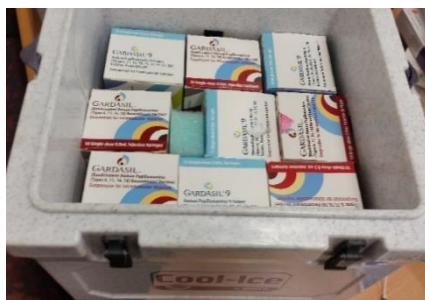
Gardasil only = 9 boxes