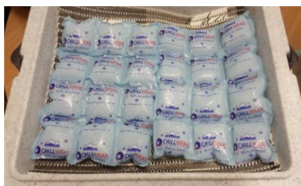
22L packed chilly bin